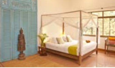
SUITE (45 - 90 sqm*)