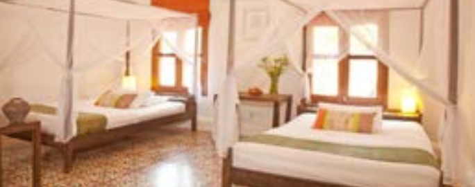
TWIN ROOM (20 - 30 sqm)