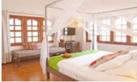
DELUXE DOUBLE ROOM (28 - 32 sqm*)