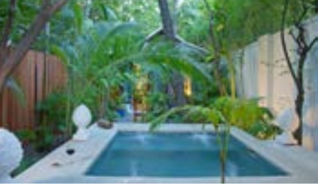
JACUZZI BUNGALOW (25 sqm*)