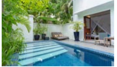
PRIVATE POOL ROOM (20 sqm*)