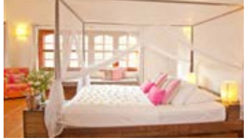
SUPERIOR DOUBLE ROOM (20 - 30 sqm*)