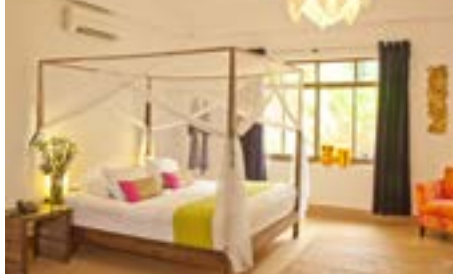
STUDIO (23 - 55 sqm*)